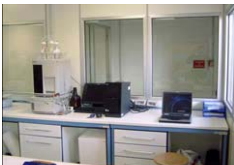
Fig 9 (Above and below) Quality Control room; Microbial analysis.