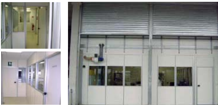
Fig 3 - Outside and inside view of production facility.