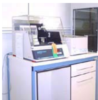
Fig 5 Media preparation equipment from left to right: Laminar Flow cabinet, Autoclave and Digital incubator Shaker

The AVITECH personnel is qualified by appropriate education, training and/or experience to perform and supervise the manufacture of intermediates and APIs. Media preparation equipment include: Vertical Laminar Flow Cabinet BIO 48-M, Precision Balance (B303 S), Viper BC-15 Balance, Ultra Low Temperature Freezer (-80), Freezer +4/-20°C, Digital Incubator Shaker (Innova 4000) for inoculum preparation, Fedegari Autoclave, Stirrer Base Units, Benchtop Centrifuge and Horizontal Rotor, Vortex Falc Mix 20, Peristaltic Pump Watson Marlow, Computerized Systems (Fig 5).