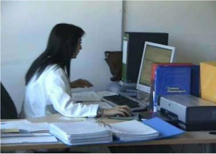
Fig 11 - QA department

The role of the Quality Assurance Department is to co-ordinate the development and maintenance of the "AVITECH" Antigen Production Unit's quality system.