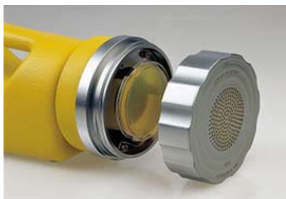
Fig 10 - (From left to right) Particle counter for air MET-ONE 227B and SAS Super 100 used for microbial count of air.