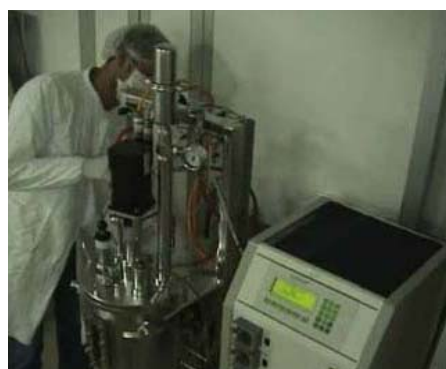
Fig 7 - (From left to right): BIOSTAT C and set-up for fermentation run.