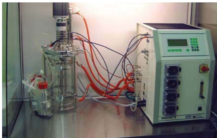
Fig 6 - BIOSTAT B

The purification of a biological product, a recombinant protein, from fermentation broth or cell culture supernatant is an important part of biotechnological manufacturing. Downstream recovery represents a large part of the product cost and therefore efficient and robust separation techniques are essential for the production of biological products. Recovering a biological product from the contaminants and impurities requires a series of purification steps, each removing some of the impurities and bringing the product closer to the final specifications. AVITECH has large experience in protein purification techniques and has developed a wide range of robust protocols to purify large quantity of final target protein.