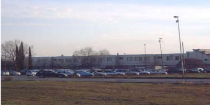
Fig 1 - Centre of Biotechnology