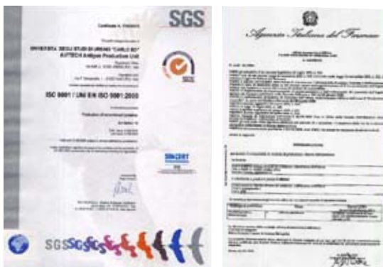
Fig 4 From left to right: ISO 9001:2000 Certification and AIFA Authorization for the production of APIs

The “AVITECH” Antigen Production Unit consists of a dedicated facility located adjacent to the main Centre of Biotechnology building (Fig 1) (a detached centre of the University of Urbino) within the industrial area of the city of Fano. The Industrial area is located in a green belt site, which is approximately two kilometres from the Centre of Fano.